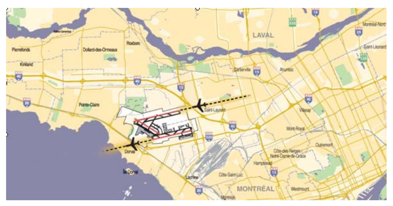
Southwesterly/westerly winds (70% of the time) Runway 24L for takeoff and 24R for landing

Keep in mind that, like other Canadian airports, Montréal–Trudeau is open 24 hours a day. However, takeoffs for aircraft weighing more than 45,000 kg are restricted from midnight to a.m. and for landings from 1 a.m. to 7 a.m.